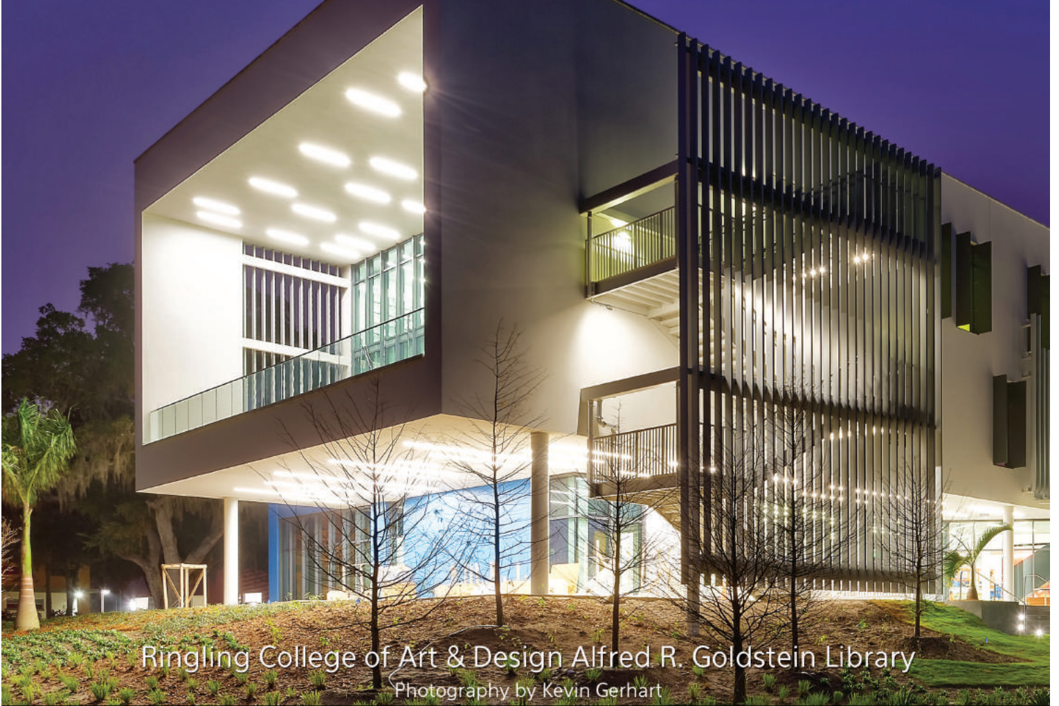
Ringling College of Art & Design Alfred R. Goldstein Library